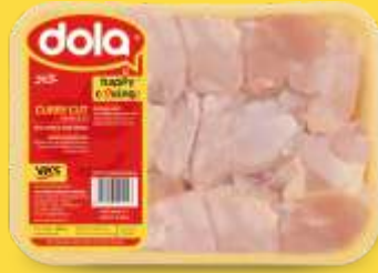
CURRY CUT SKINLESS